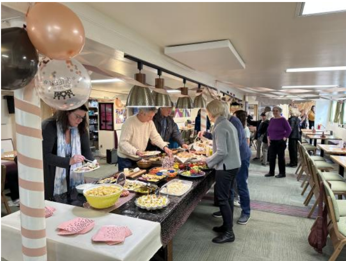
(more photos throughout this newsletter)