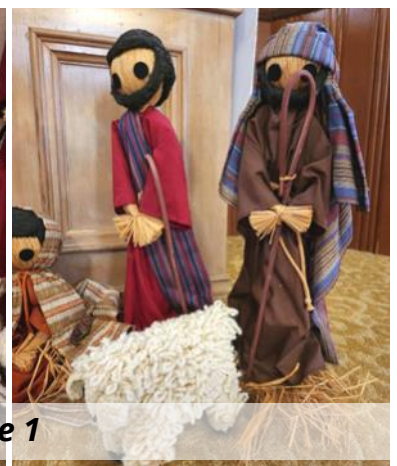
Close-up photos of our Nativity Set, from page 1