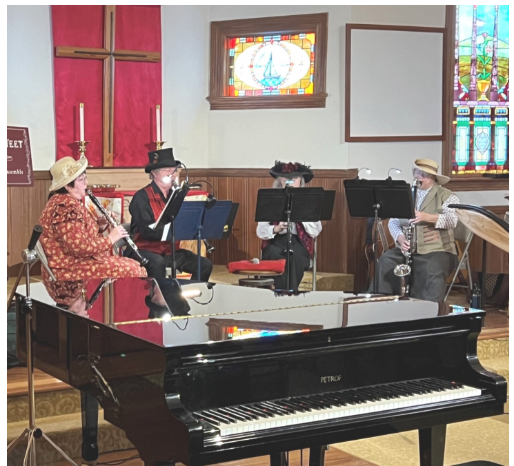
May's Candlelight Concert with Toot Sweet

Trinity United Methodist Church is located at 609 Taylor Street, across from the Community Center, in Uptown. Attendees should plan on arriving early – doors will open at 6:30. Masks are encouraged for in-person attendees.