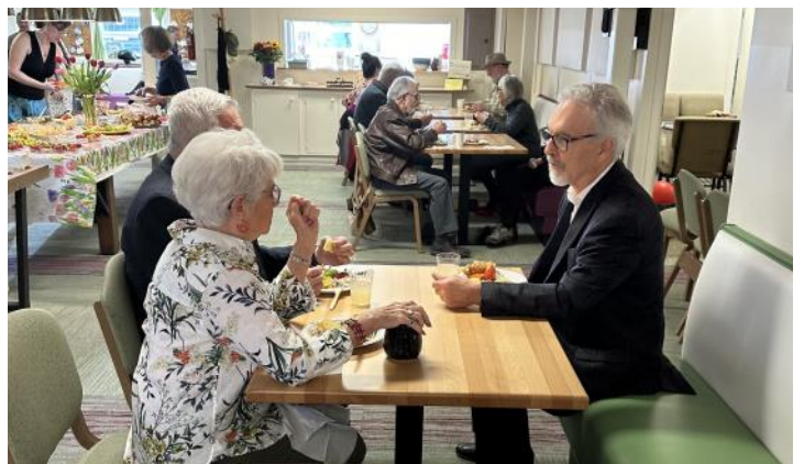
More photos on page 8