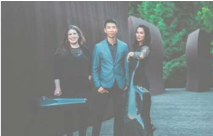
The Vesper Piano Trio

We'll send out more information via email soon. In the meantime, please enjoy the photos here of the Vesper Trio and our summer concerts!