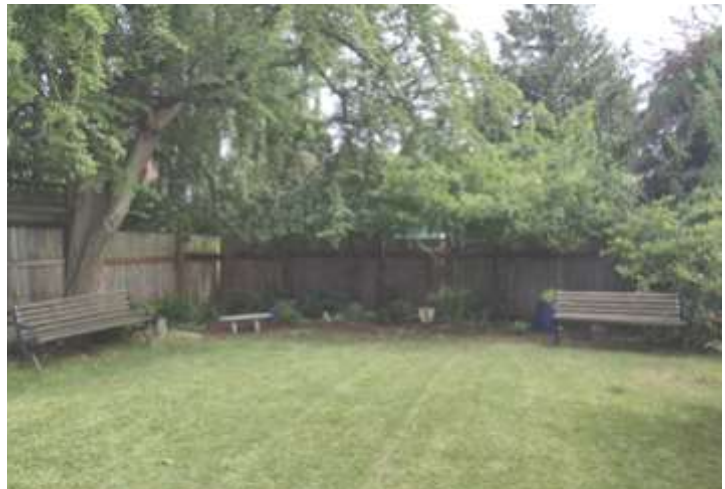
June clean-up day of our garden areas