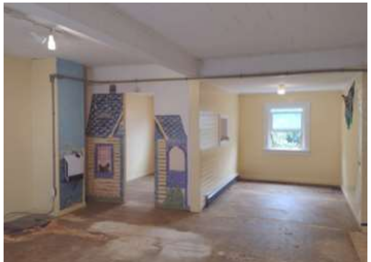
Clearing out Firefly Preschool for the incoming Dragonfly