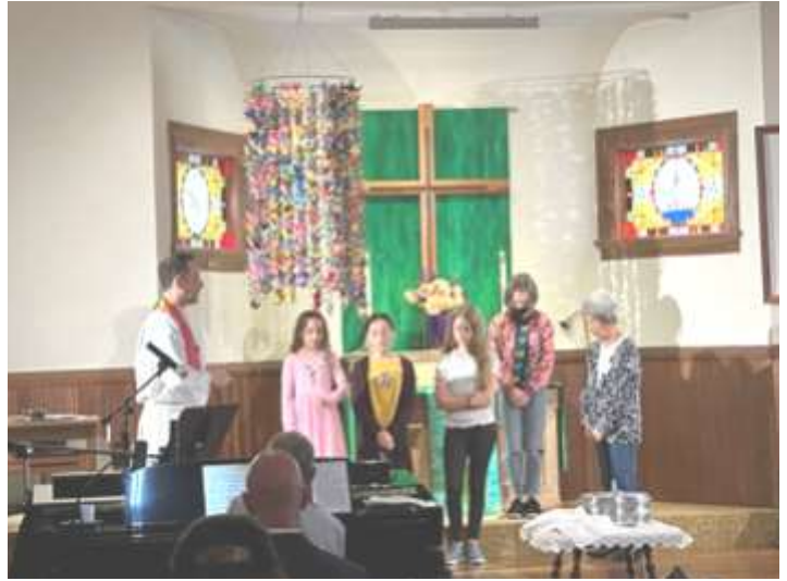
Unveiling of Wacky Wednesday's 1,000 Peace Cranes (bulletin board in Fellowship Hall has the whole story)