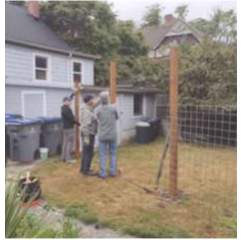
Our new fence