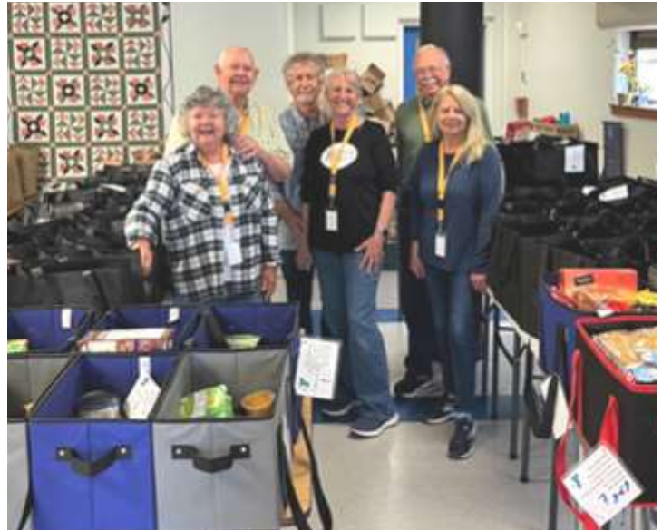
The YMCA really appreciates how Trinity stepped up to help with summer lunches for kids!