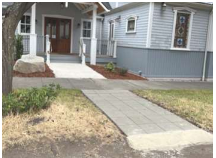
Our new walkway from the street