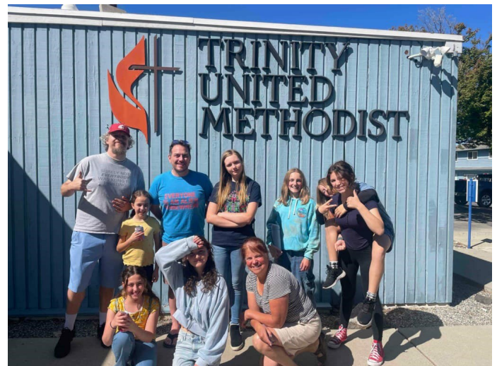
You can see more photos of this trip in our Trinity Life & Community pages—page 15.