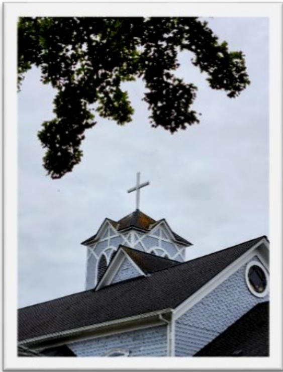
View from the garden

He speaks, and the sound of His voice Is so sweet the birds hush their singing, And the melody that He gave to me Within my heart is ringing.