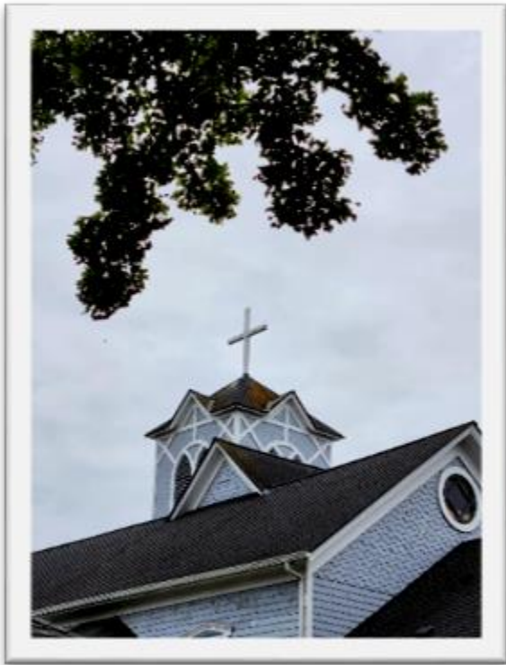
View from the garden

He speaks, and the sound of His voice Is so sweet the birds hush their singing, And the melody that He gave to me Within my heart is ringing.