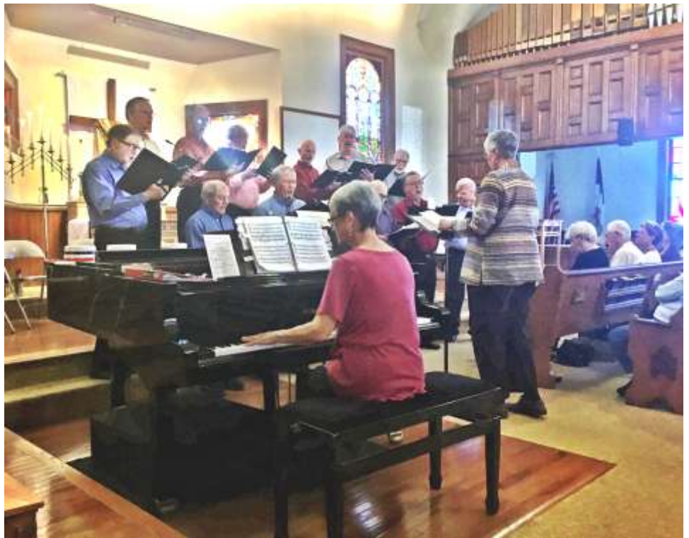
Singers in the Rain performing at our May concert. Thanks for a wonderful show!

Office Hours: 9 — noon Monday, Tuesday, & Wednesday