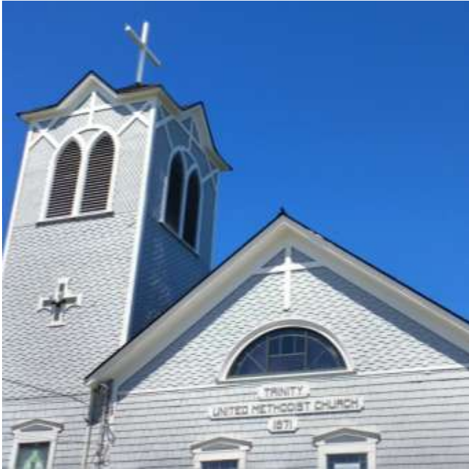
After the work was completed!